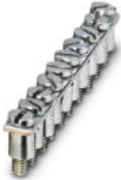
Fixed bridge, Pitch: 4.2 mm, Number of positions: 10, Color: silver

Please be informed that the data shown in this PDF Document is generated from our Online Catalog. Please find the complete data in the user's documentation. Our General Terms of Use for Downloads are valid ( http://phoenixcontact.com/download )